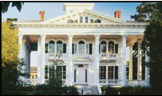
Bellamy Mansion and Museum