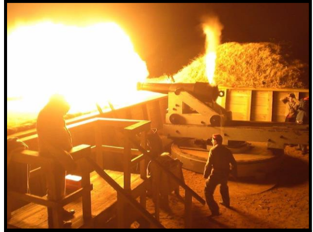
Night firing of a 32 pounder at Fort Fisher