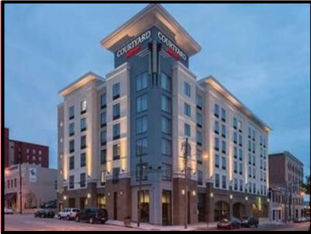
Courtyard by Marriott Wilmington Downtown - Our 2015 Convention Hotel

BUSINESS MEETING LUNCH ON YOUR OWN FREE TIME IN THE AFTERNOON BANQUET IN EVENING W/PROGRAM