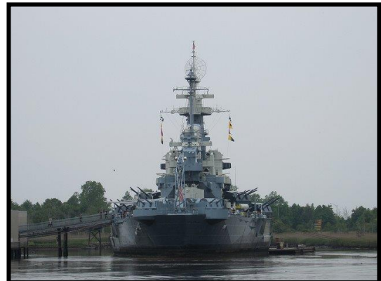
USS North Carolina